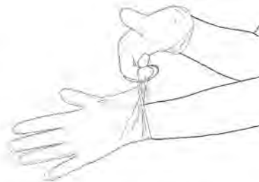
5. To avoid touching the skin of the forearm with the gloved hand, turn the external surface of the glove to be donned on the folded fingers of the gloved hand, thus permitting to glove the second hand