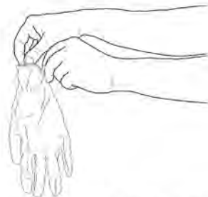
2. Touch only a restricted surface of the glove corresponding to the wrist (at the top edge of the cuff)