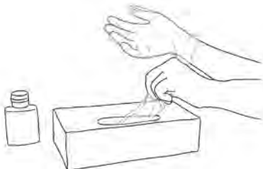
4. Take the second glove with the bare hand and touch only a restricted surface of glove corresponding to the wrist