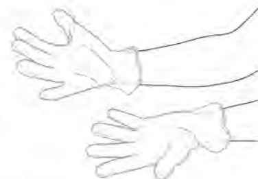
6. Once gloved, hands should not touch anything else that is not defined by indications and conditions for glove use