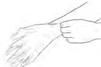
3. Don the first glove