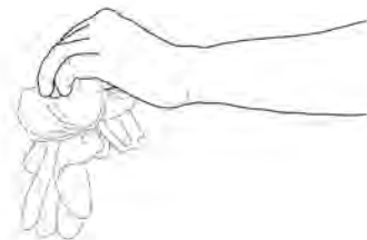
3. Discard the removed gloves

4. Then, perform hand hygiene by rubbing with an alcohol-based handrub or by washing with soap and water